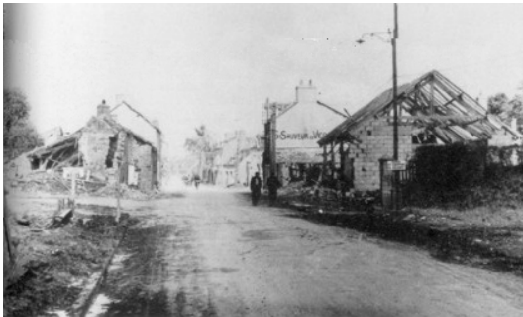
Carentan, where Easy fought its first big battle as an intact company. Winters led the men down the road coming in from the left in a frontal assault against a German machine-gun position in the building to the right.