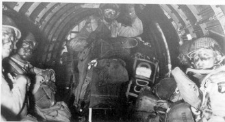
Army Signal Corps