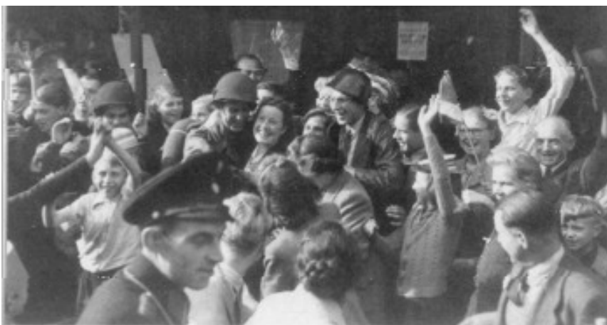
The people of Eindhoven welcome their liberators from Easy Company and the 506th, September 18, 1944.