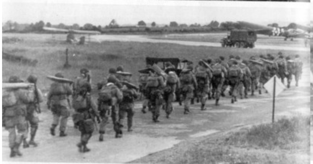
Army Signal Corps