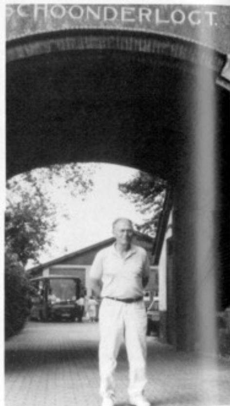
Major Winters under the same gate in Holland as in October 1944, forty-seven years later.