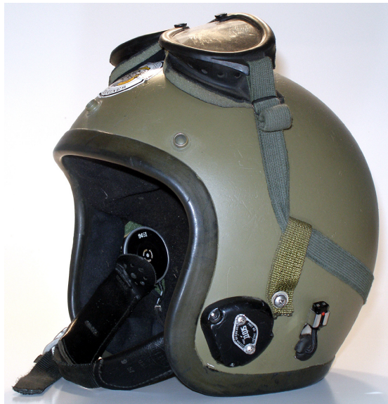
FIG 1. Bell motorcycle helmet ca. 1974. Earphones, goggle retention straps, and Gentex bayonet clips added by USMC probably in 1977 during motorcycle tests at Twenty Nine Palms, CA. Author's collection.

could be configured, with the addition of specific components, to serve the needs of various USMC specialty jobs. The helmet designations were: MC-140 Helicopter Support Team Helmet, MC-140A Amphibious Crewman Helmet, MC-140B Artilleryman's Helmet with Communications, MC-140C Artilleryman's Helmet without Communications, MC-140D Motorcyclist's Helmet with Communications, and MC-140E Communicator's Helmet (CVC helmet). 4 The MC-140D, while on the low end of the ballistic protection scale, did rate well with regards to weight, noise attenuation, wind resistance,