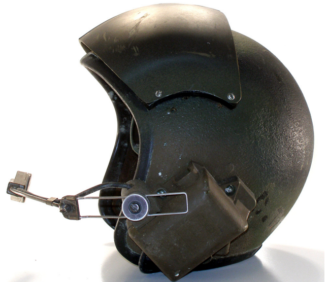
FIG 3. U.S. Army T56-6 Combat Vehicle Crewman helmet. The visor housing assembly from an SPH-4 flight helmet has been attached to this helmet for an eye shield. Author's collection.

and radio communication. In 1984, the USMC requested that Gentex Corporation revisit this helmet design and try to reduce helmet weight, increase ballistic protection, and reduce per unit cost. 5 The resulting helmet was called the MC-140D Modified (FIG 6). The MC-140D Modified version did, in fact, show a small increase in overall helmet weight which was the trade off for increased ballistic protection. 6 To meet the request for increased ballistic protection, Gentex Corporation designers increased the number of Kevlar® layers used in the helmet's construction to fifteen plies which provided a protection level