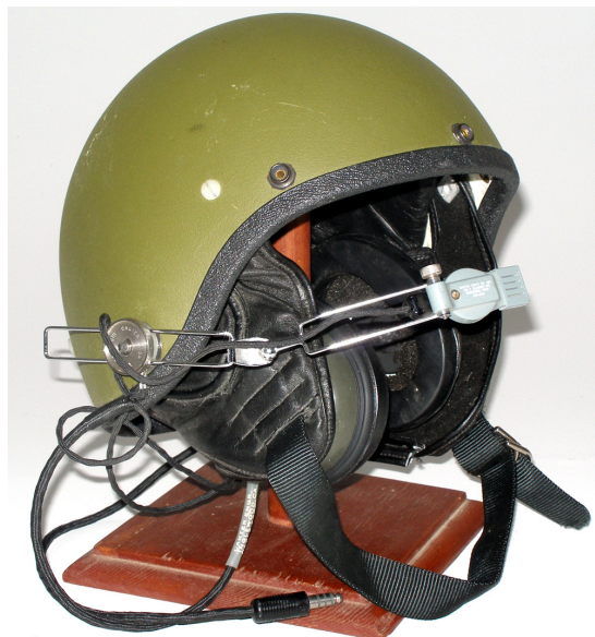
FIG 8. Produced in 1985, this prototype Scott Headguard SD-357 was very similar in appearance to the Gentex MMH I. Neither helmet was adopted by the Army.

Corporation submitted a design similar to the MC-140D Modified which it named the MMH I (FIG 7). This helmet had a ballistic protection rating of not less than v50 1600 FPS 9 which made it at least equivalent to the MC-140D Modified. Only twenty-five of the MMH I helmets were produced for Army testing and field evaluations. 10 Also in 1985, the Scott Company submitted a design which they called the Headguard SD-357 (FIG 8). This helmet provided ballistic protection of v50 1395 FPS (FIG 9). It is not known how many of the SD-357 helmets were produced or if any were actually procured, although based on the ballistic properties, it is doubtful the Army actually bought any.