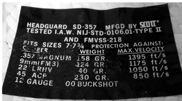
FIG 9. Interior label of the Scott Headguard SD-357 showing the ballistic qualities of the helmet.

Corporation submitted a design similar to the MC-140D Modified which it named the MMH I (FIG 7). This helmet had a ballistic protection rating of not less than v50 1600 FPS 9 which made it at least equivalent to the MC-140D Modified. Only twenty-five of the MMH I helmets were produced for Army testing and field evaluations. 10 Also in 1985, the Scott Company submitted a design which they called the Headguard SD-357 (FIG 8). This helmet provided ballistic protection of v50 1395 FPS (FIG 9). It is not known how many of the SD-357 helmets were produced or if any were actually procured, although based on the ballistic properties, it is doubtful the Army actually bought any.