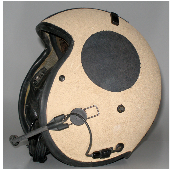
FIG 11. Special Operations (Desert) version of the Gentex MMH II produced in July 1999 for the U.S. Army. This helmet is the same as shown in FIG 10 but instead of a smooth OD green surface it has a rough textured finish and sand yellow color. The MMH II also comes in a rough coat flat black color scheme.