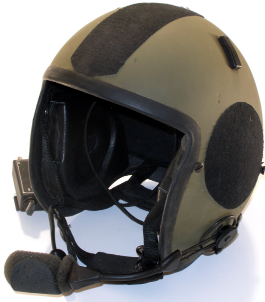
FIG 10. The Gentex MMH II helmet, designed in 1992 and still used today by U.S. Army and U.S. Air Force special operations forces. Author's collection.

The last combat motorcycle helmet produced, to date, is the Gentex Corporation produced MMH II (FIG 10). Produced in 1992, this helmet reflected a redesign of the previous MMH I. The MMH II has a ballistic protection rating of v50 at 1600 FPS and is compatible with the M40 Protective Mask and the MBU-12 Oxygen Mask. It can be configured with a protective lower face shield, an active hearing protection (AHP) system, and is compatible with a wide range of military radios and intercom systems. 11 The U.S. Army and U.S. Air Force purchased seven hundred of these helmets in 1992 for the use of special operations forces. 12 This helmet is still carried in Army and Air Force inventories as a special issue item and is still actively marketed by Gentex Corporation.