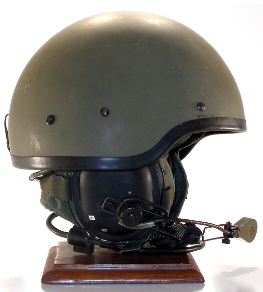
FIG 7. MMH I helmet produced by Gentex Corporation in 1985. Only twenty-five of these prototype helmets were made for Army field tests. Author's collection.

In 1985, the U.S. Army expressed an interest in a helmet for crews of fast attack vehicles and motorcycles. Gentex