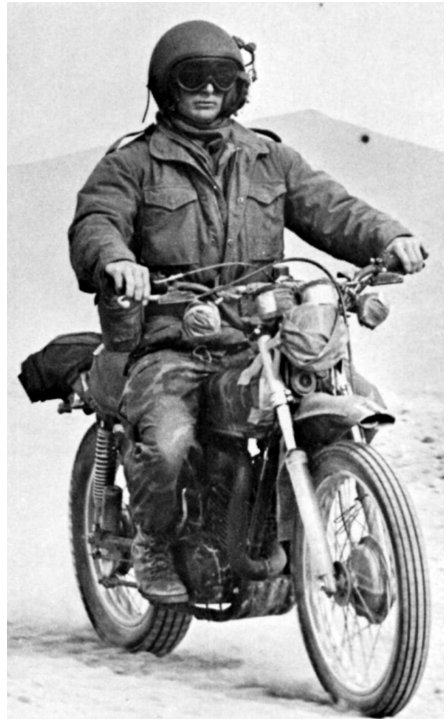
FIG 4. Marine motorcyclist during testing at Twenty Nine Palms in 1977. He is wearing an Army T56-6 Combat Vehicle Crewman's helmet.