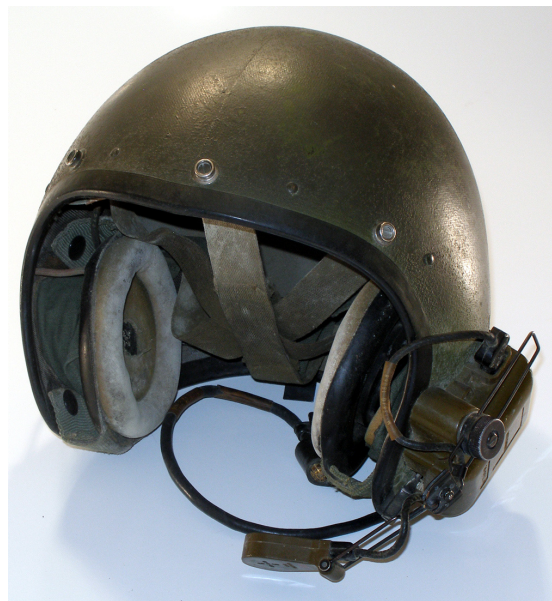
FIG 2. U.S. Army T56-6 Combat Vehicle Crewman helmet with 3 DOT type snap fasteners added over the brow for an eye shield. Author's collection.

could be configured, with the addition of specific components, to serve the needs of various USMC specialty jobs. The helmet designations were: MC-140 Helicopter Support Team Helmet, MC-140A Amphibious Crewman Helmet, MC-140B Artilleryman's Helmet with Communications, MC-140C Artilleryman's Helmet without Communications, MC-140D Motorcyclist's Helmet with Communications, and MC-140E Communicator's Helmet (CVC helmet). 4 The MC-140D, while on the low end of the ballistic protection scale, did rate well with regards to weight, noise attenuation, wind resistance,