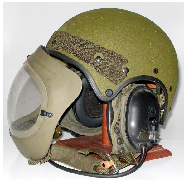
FIG 5. The MC-140D, the first specially designed combat motorcycle helmet. Designed for the USMC by Gentex Corporation in 1981. Shown with ballistic face shield removed.

and radio communication. In 1984, the USMC requested that Gentex Corporation revisit this helmet design and try to reduce helmet weight, increase ballistic protection, and reduce per unit cost. 5 The resulting helmet was called the MC-140D Modified (FIG 6). The MC-140D Modified version did, in fact, show a small increase in overall helmet weight which was the trade off for increased ballistic protection. 6 To meet the request for increased ballistic protection, Gentex Corporation designers increased the number of Kevlar® layers used in the helmet's construction to fifteen plies which provided a protection level